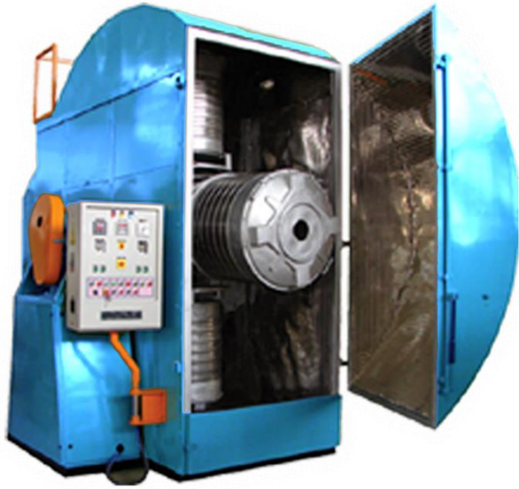
EN 2000x2 SP